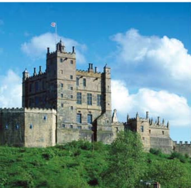
Bolsover Castle , Castle Street, Bolsover, Derbyshire S44 6PR t. 01246 822844 e. bolsover.castle@english-heritage.org.uk

Sir Charles Cavendish, Bess of Hardwick's son, created this medieval styled, romantic fantasy castle in north Derbyshire at the turn of the 16th century. His designs were further embellished by his son, William Cavendish, the first of Bess's dynasty to be made a Duke, with the latest style in decorative finishes. A new exhibition in the stables allows you to discover William's remarkable equestrian legacy, his passion for horses and his contribution to the modern sport of dressage. Explore room after room of the castle with the free adult or child audio tour to discover the flamboyant history of this magnificent world designed for lavish hospitality. This tradition of entertainment continues at the castle with its extensive events programme, details of which can be found at www.english-heritage.org.uk/bolsovercastle